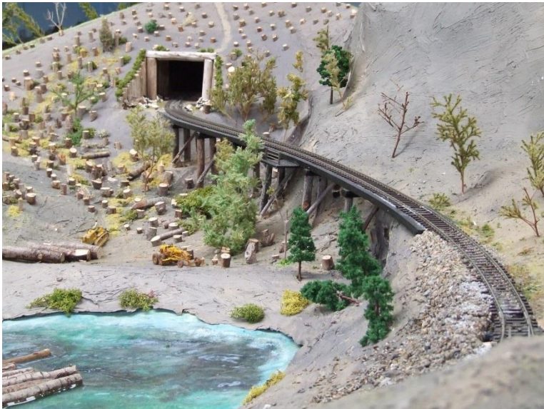
Above: A photograph taken from the embankment above the logging siding looking up across the bridge toward the tunnel on the way to the saw mill at Wallaceton.

https://www.facebook.com/noarlungarailroaders