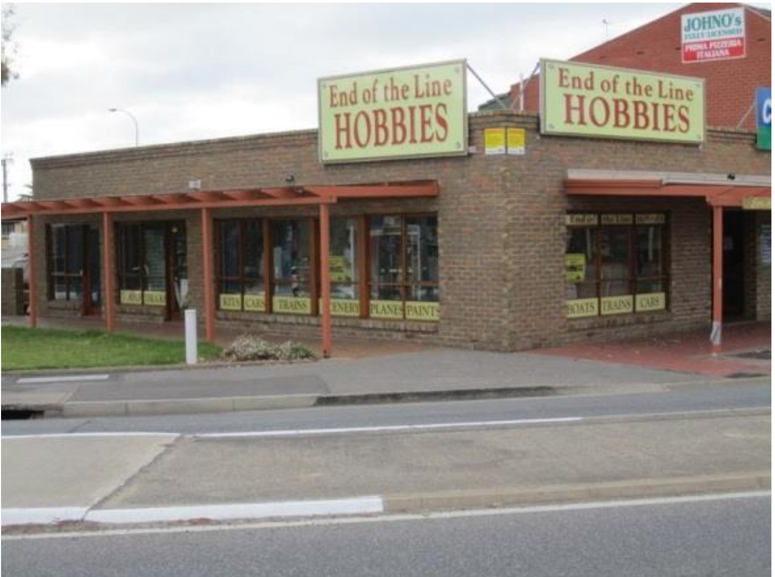
A larger than usual ad for EotLH to celebrate the safe arrival of the photo of 'the new shop - and as return 'thanks' to Paul for those 'GH' bits...

Fax 8552 7933 Email shop@endofthelinehobbies.com.au