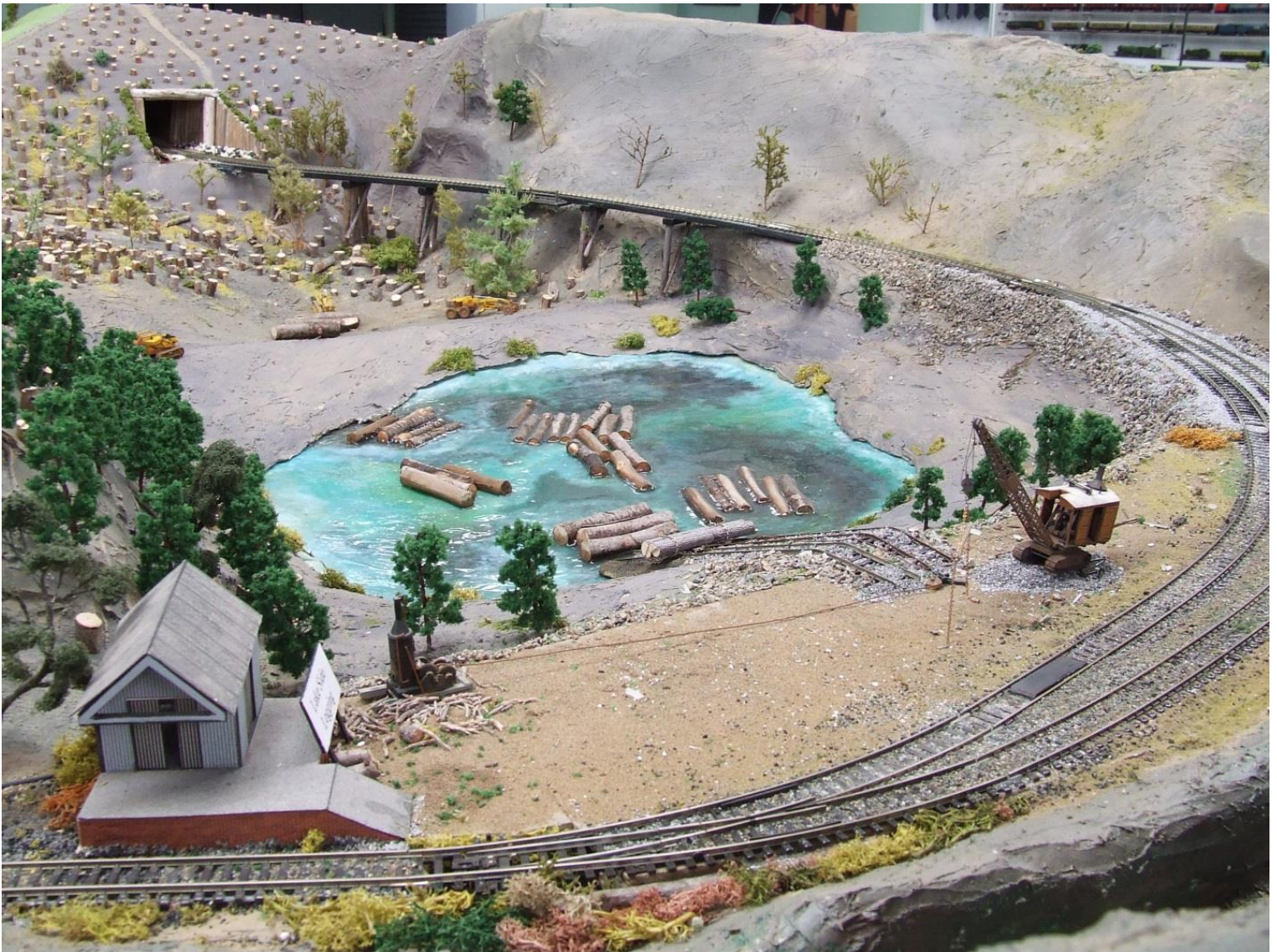
An overhead view looking down into the logging area and lake

Please send items for inclusion in this newsletter to the Editor via e-mail at editor@noarail.com This newsletter is available as a download from our website (address above) saving the club postage and printing. Most pictures are in colour, and notification is sent by email when it is available for download.